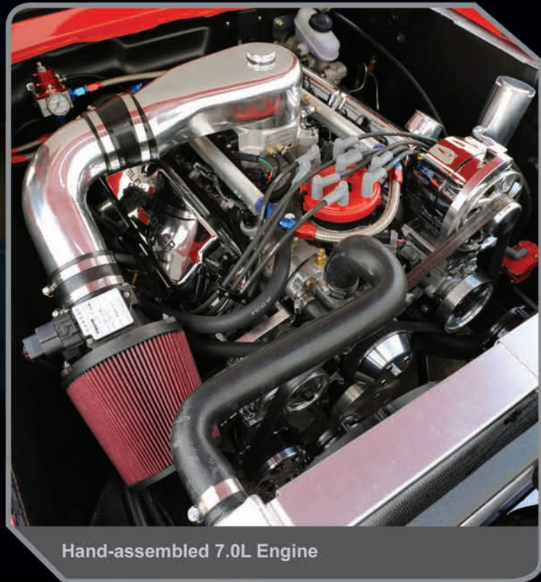
Hand-assembled 7.0L Engine