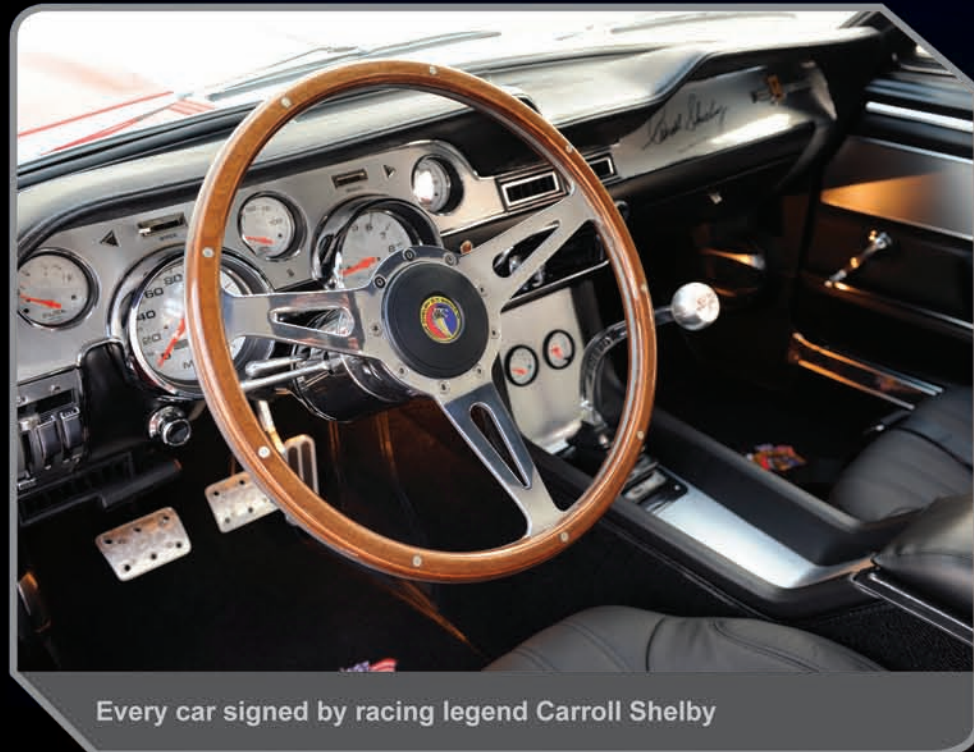
Every car signed by racing legend Carroll Shelby